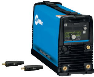
907552 Maxstar shown.

Select desired stock number for each step.