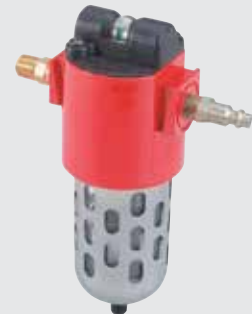
Air filtration kit